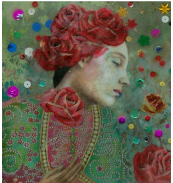
Lori Field, „Anastasia“, color pencil drawing, encaustic, 12 x 12 cm, 2009

Nina Nolte, „The Best Things in Life are Free“, acrylic on canvas, 100 x 200 cm, 2009